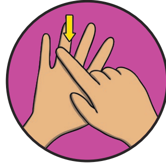
Tap your finger.